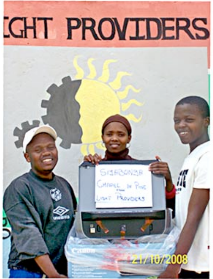
World Changers Academy (WCA) and Loving South Africa ( http://www.lovinglsa.org ) have generously given to Light Providers two desktop computers.